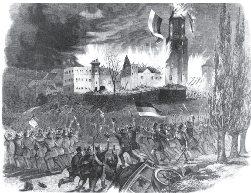
Fig. 9 – Peasants' uprising, 1848.

National Assembly proclaimed a Republic, granted suffrage to all adult males above 21, and guaranteed the right to work. National workshops to provide employment were set up.