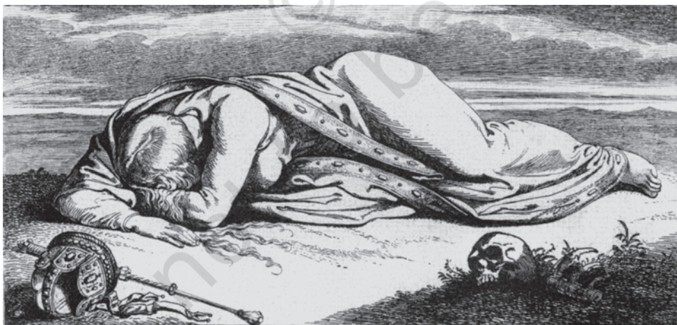
Fig. 18 – The fallen Germania, Julius Hübner, 1850.