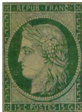
Fig. 16 – Postage stamps of 1850 with the figure of Marianne representing the Republic of France.

Allegory – When an abstract idea (for instance, greed, envy, freedom, liberty) is expressed through a person or a thing. An allegorical story has two meanings, one literal and one symbolic