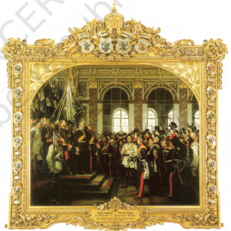
Fig. 11 – The proclamation of the German empire in the Hall of Mirrors at Versailles, Anton von Werner. At the centre stands the Kaiser and the chief commander of the Prussian army, General von Roon. Near them is Bismarck. This monumental work (2.7m x 2.7m) was completed and presented by the artist to Bismarck on the latter's 70th birthday in 1885.

The nation-building process in Germany had demonstrated the dominance of Prussian state power. The new state placed a strong emphasis on modernising the currency, banking, legal and judicial systems in Germany. Prussian measures and practices often became a model for the rest of Germany.