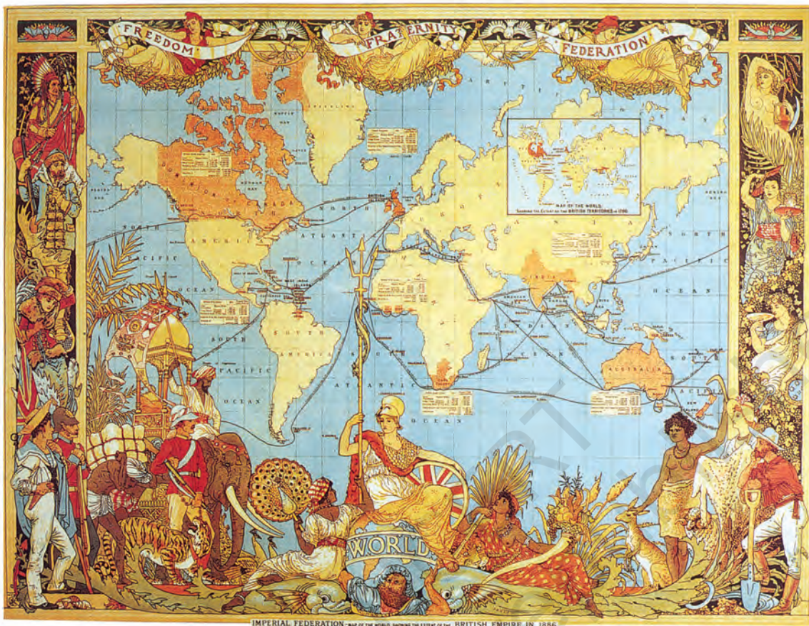
Fig. 20 – A map celebrating the British Empire.

At the top, angels are shown carrying the banner of freedom. In the foreground, Britannia – the symbol of the British nation – is triumphantly sitting over the globe. The colonies are represented through images of tigers, elephants, forests and primitive people. The domination of the world is shown as the basis of Britain's national pride.