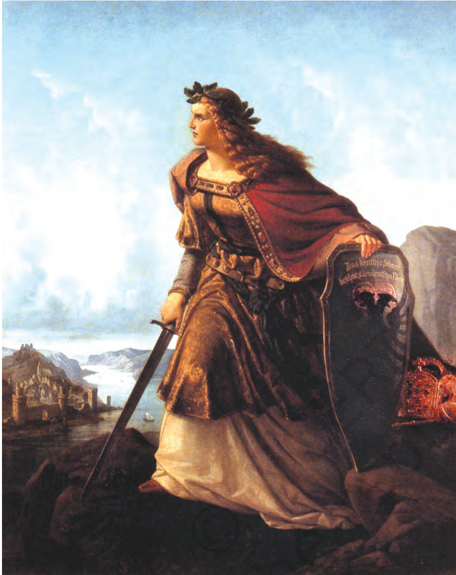
Fig. 19 — Germania guarding the Rhine.

In 1860, the artist Lorenz Clasen was commissioned to paint this image. The inscription on Germania's sword reads: 'The German sword protects the German Rhine.'