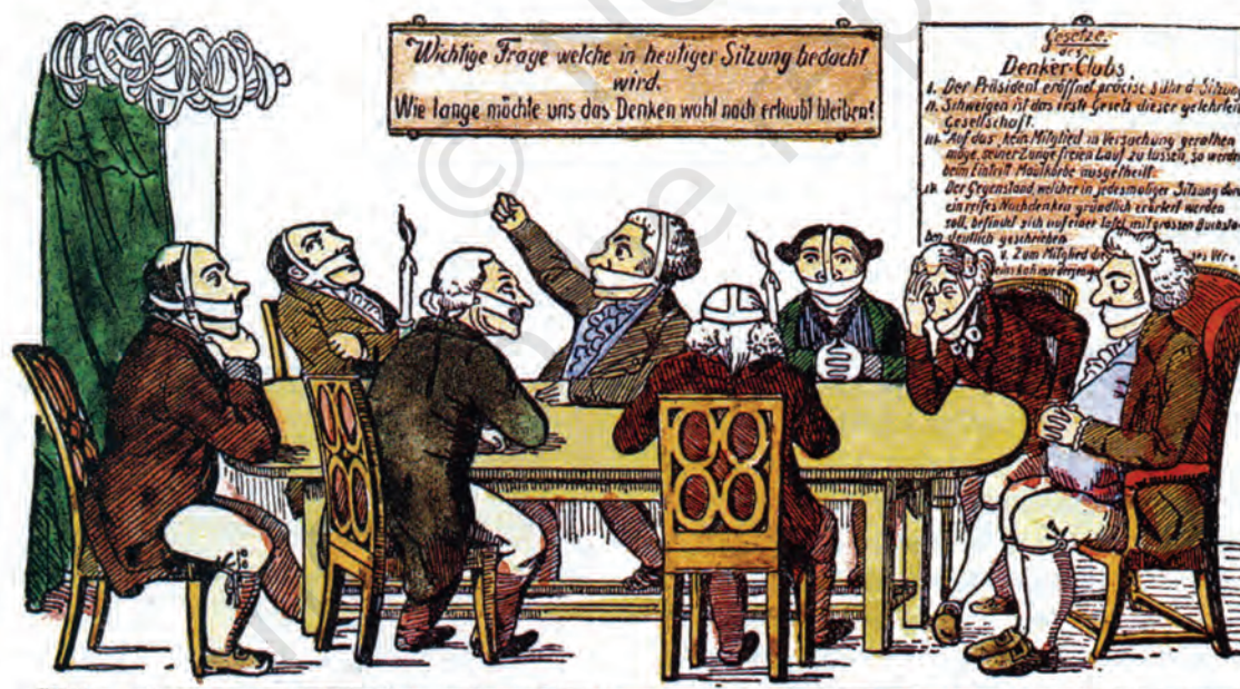
Fig. 6 – The Club of Thinkers, anonymous caricature dating to c. 1820.

What is the caricaturist trying to depict?