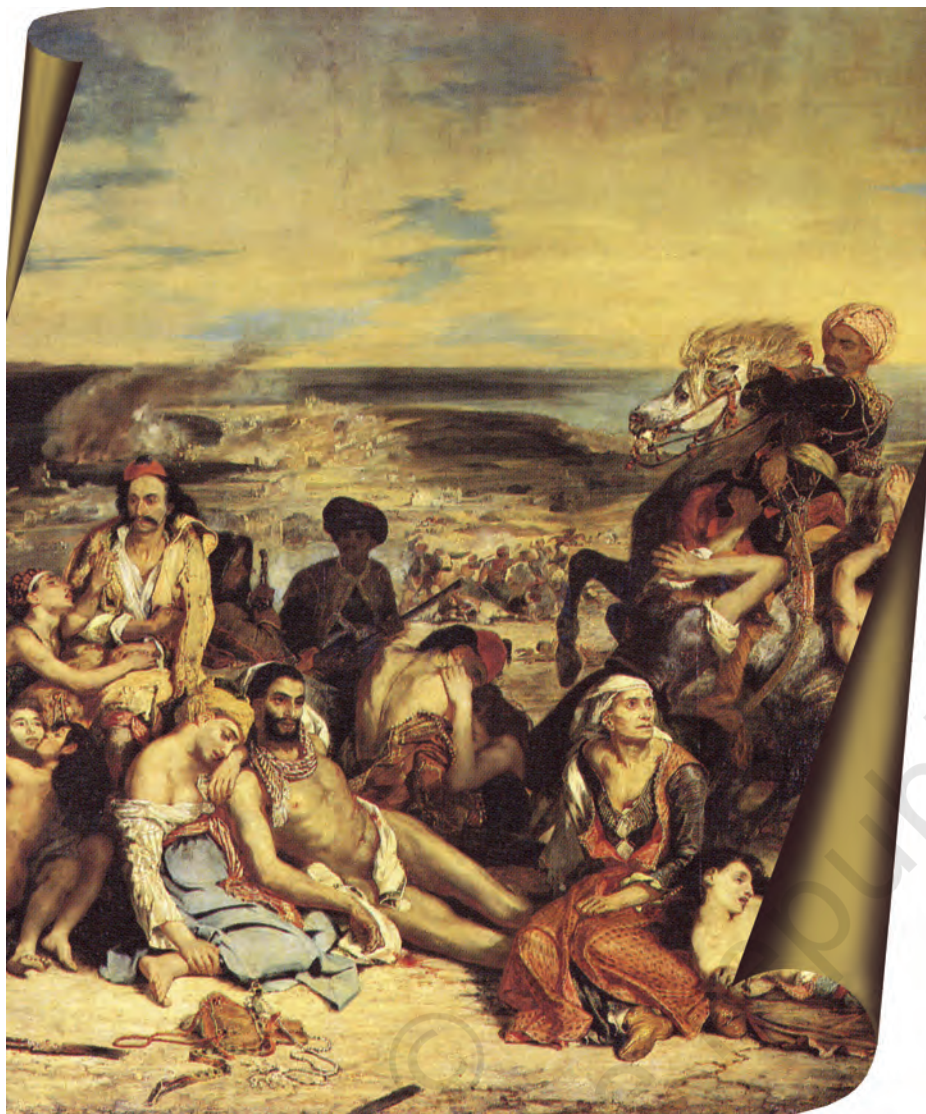
Fig. 8 – The Massacre at Chios, Eugene Delacroix, 1824.

The French painter Delacroix was one of the most important French Romantic painters. This huge painting (4.19m x 3.54m) depicts an incident in which 20,000 Greeks were said to have been killed by Turks on the island of Chios. By dramatising the incident, focusing on the suffering of women and children, and using vivid colours, Delacroix sought to appeal to the emotions of the spectators, and create sympathy for the Greeks.