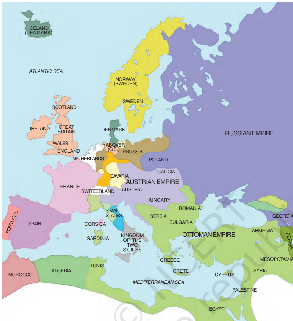
Fig. 3 – Europe after the Congress of Vienna, 1815.

Within the wide swathe of territory that came under his control, Napoleon set about introducing many of the reforms that he had already introduced in France. Through a return to monarchy Napoleon had, no doubt, destroyed democracy in France, but in the administrative field he had incorporated revolutionary principles in order to make the whole system more rational and efficient. The Civil Code of 1804 – usually known as the Napoleonic Code – did away with all privileges based on birth, established equality before the law and secured the right to property. This Code was exported to the regions under French control. In the Dutch Republic, in Switzerland, in Italy and Germany, Napoleon simplified administrative divisions, abolished the feudal system and freed peasants from serfdom and manorial dues. In the towns too, guild restrictions were removed. Transport and communication systems were improved. Peasants, artisans, workers and new businessmen