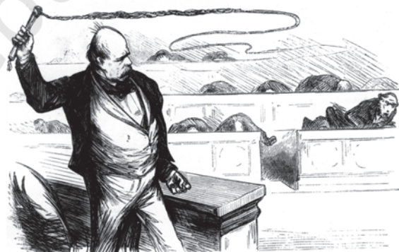
Fig. 13 – Caricature of Otto von Bismarck in the German reichstag (parliament), from Figaro, Vienna, 5 March 1870.

During the 1830s, Giuseppe Mazzini had sought to put together a coherent programme for a unitary Italian Republic. He had also formed a secret society called Young Italy for the dissemination of his goals. The failure of revolutionary uprisings both in 1831 and 1848 meant that the mantle now fell on Sardinia-Piedmont under its ruler King Victor Emmanuel II to unify the Italian states through war. In the eyes of the ruling elites of this region, a unified Italy offered them the possibility of economic development and political dominance.