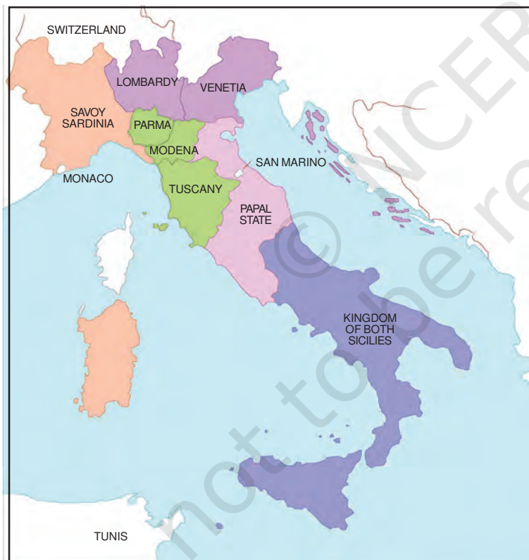
Fig. 14(a) – Italian states before unification, 1858.

Look at Fig. 14(a). Do you think that the people living in any of these regions thought of themselves as Italians? Examine Fig. 14(b). Which was the first region to become a part of unified Italy? Which was the last region to join? In which year did the largest number of states join?