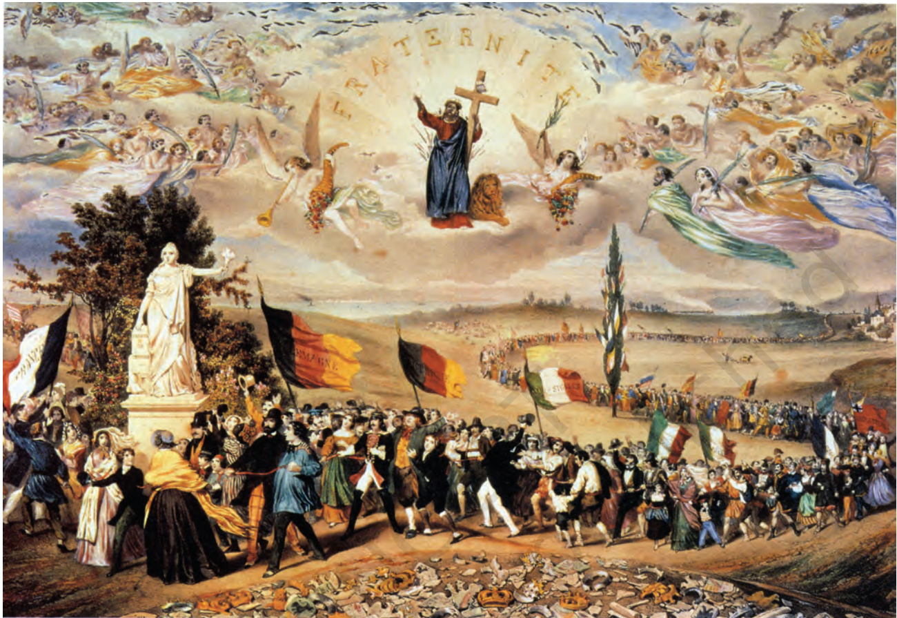
Fig. 1 – The Dream of Worldwide Democratic and Social Republics – The Pact Between Nations, a print prepared by Frédéric Sorrieu, 1848.

In 1848, Frédéric Sorrieu, a French artist, prepared a series of four prints visualising his dream of a world made up of ‘democratic and social Republics’, as he called them. The first print (Fig. 1) of the series, shows the peoples of Europe and America – men and women of all ages and social classes – marching in a long train, and offering homage to the statue of Liberty as they pass by it. As you would recall, artists of the time of the French Revolution personified Liberty as a female figure – here you can recognise the torch of Enlightenment she bears in one hand and the Charter of the Rights of Man in the other. On the earth in the foreground of the image lie the shattered remains of the symbols of absolutist institutions. In Sorrieu’s utopian vision, the peoples of the world are grouped as distinct nations, identified through their flags and national costume. Leading the procession, way past the statue of Liberty, are the United States and Switzerland, which by this time were already nation-states. France,