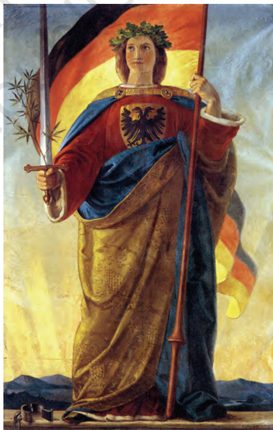
Fig. 17 – Germania, Philip Veit, 1848. The artist prepared this painting of Germania on a cotton banner, as it was meant to hang from the ceiling of the Church of St Paul where the Frankfurt parliament was convened in March 1848.