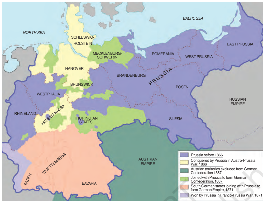
Fig. 12 – Unification of Germany (1866-71).