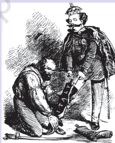
Fig. 15 – Garibaldi helping King Victor Emmanuel II of Sardinia-Piedmont to pull on the boot named ‘Italy’. English caricature of 1859.

In 1867, Garibaldi led an army of volunteers to Rome to fight the last obstacle to the unification of Italy, the Papal States where a French garrison was stationed. The Red Shirts proved to be no match for the combined French and Papal troops. It was only in 1870 when, during the war with Prussia, France withdrew its troops from Rome that the Papal States were finally joined to Italy.